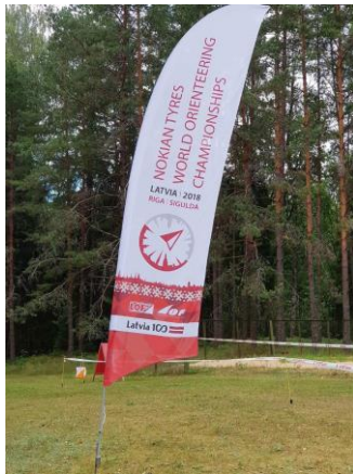
Circle (O) = beach flag